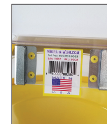
Removeable Sign Holder for Transportation