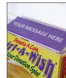
Optional Sponsorship Acrylic Holder