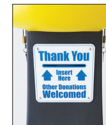
Optional Donation Insert Slot

Entertain your customers while raising funds!